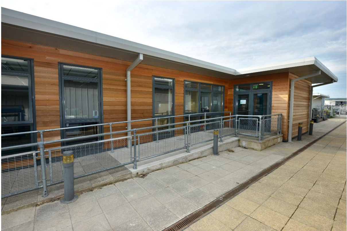
Above is SCDA's HQ, Denton Island Community Centre in Newhaven