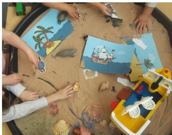
Below is an activity from children in SCDA's Denton Island Nursery