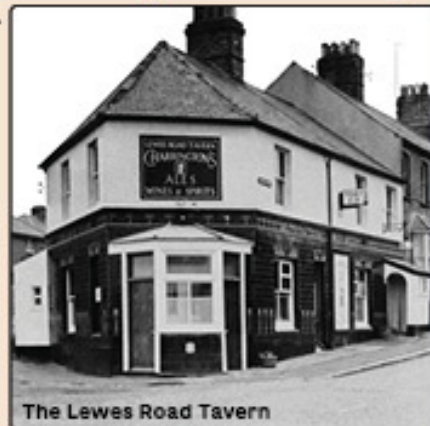
The Lewes Road Tavern

Before we can get to that, we've got a lot of renovation work to do to meet modern hygiene, health & safety standards. Plus, a couple of fun changes while we're there..