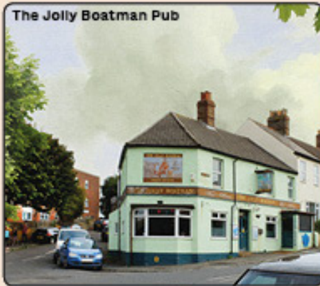
The Jolly Boatman Pub

The Story so far - The plan - Have your say