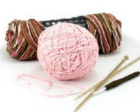
Knit & natter