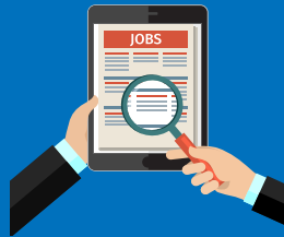
Supported Job Search